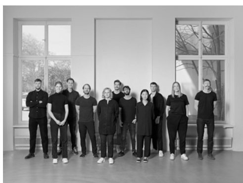
Designed by Form Us With Love

Offered in a variety of ways including a practical side table, the soft club chair, evokes the idea of recreation and productivity taking place in the same seat. The DNA of NEST is capturing a sense of belonging, a space that shelters us, and this is further pronounced in the range's newest addition — NEST Club Chair.