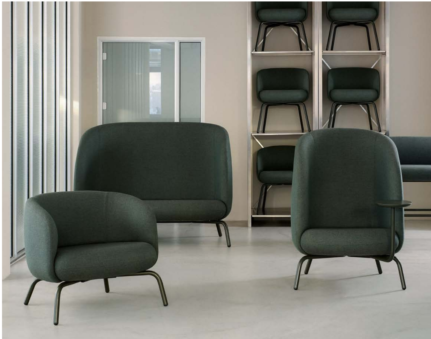
Part of the NEST Collection