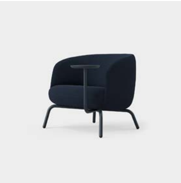
NEST Club Chair w. Table right

Height: 770mm Depth: 1100mm Width: 890mm Seat Height: 450mm