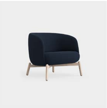
NEST Club Chair Oak

Height: 770mm Depth: 850mm Width: 870mm Seat Height: 450mm