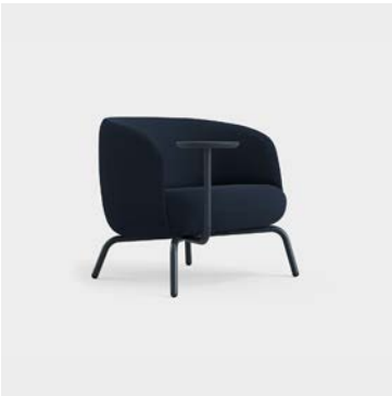
NEST Club Chair w. Table left

Height: 770mm Depth: 850mm Width: 870mm Seat Height: 450mm