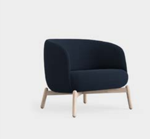
NEST Club Chair Oak

Height: 770mm Depth: 850mm Width: 870mm Seat Height: 450mm