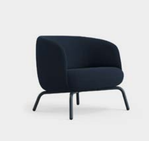
NEST Club Chair

Height: 770mm Depth: 850mm Width: 870mm Seat Height: 450mm