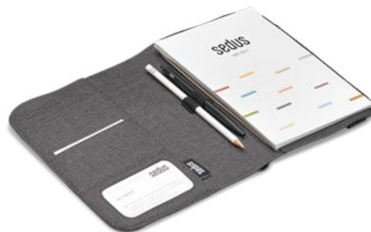
Conference folder – suitable for notepads in DIN A5 (dimensions when closed: 18 x 23 x 2 cm)