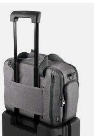
Can be securely attached to a trolley by means of an external trolley strap