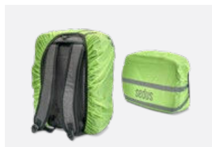
The rain cover with reflectors also ensures extra safety in bad weather

Using the practical cable grommets, it is possible to connect electronic devices to a powerbank for charging