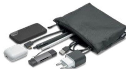
Hygiene bag (dimensions: 19.5 x 14.5 cm)